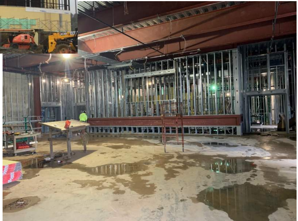
Theater – AV Booth Framing