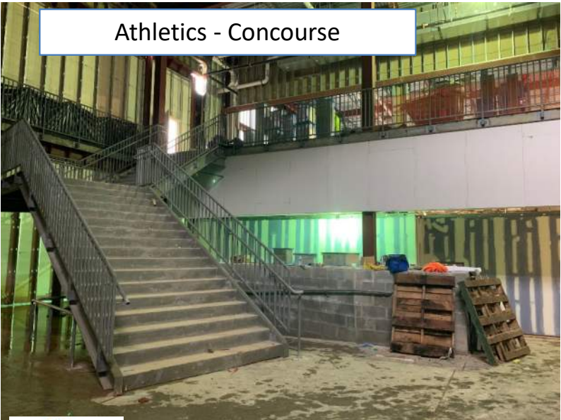
Athletics - Concourse