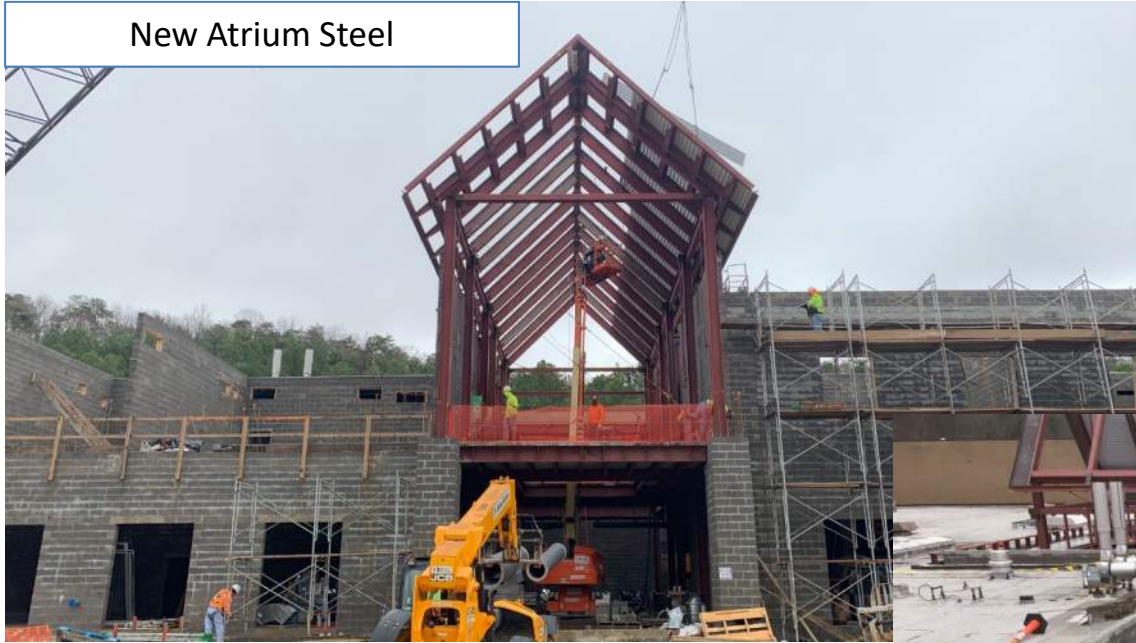
New Atrium Steel