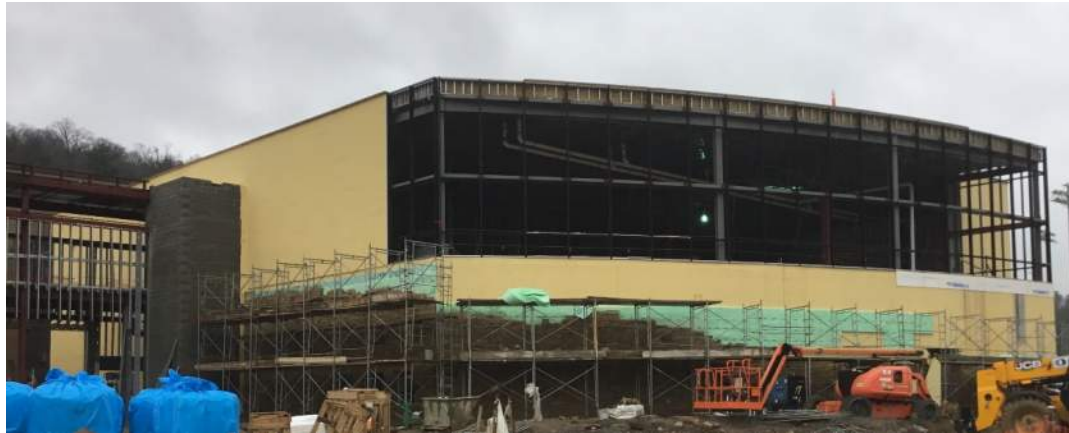
Arts – Exterior Skin